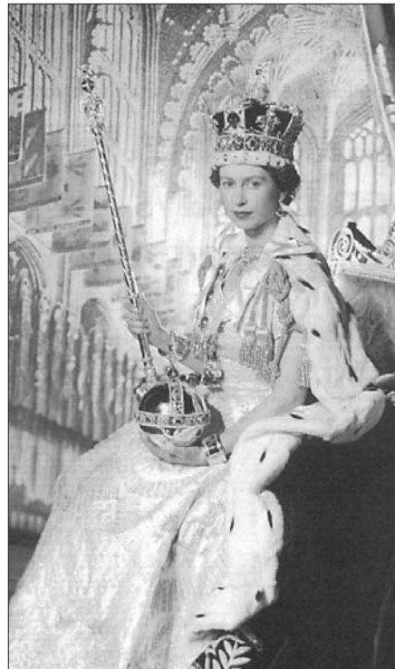
The Queen on Coronation Day wearing the Imperial State Crown.

The St. Edward's Crown is made of gold and set with jewels, none of which have any particular significance, unlike many of the jewels in the Imperial State