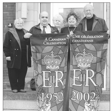
Comox Branch members attend Golden Jubilee Banner presentation to Courtenay Historical Society.