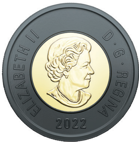
Royal Canadian Mint: Mourning coin for Elizabeth II needs to be complemented by current coinage depicting The King. Hommage à la reine Elizabeth II doit être complétée par la pièce actuelle représentant le Roi.

PROGRAM OF STATE CELEBRATIONS ACROSS CANADA, not yet been announced, let alone public input sought?