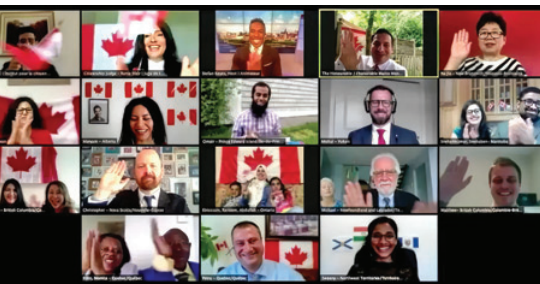
La cérémonie de citoyenneté virtuelle pendant la COVID ne doit pas devenir la nouvelle norme.

canadagazette.gc.ca/ rp-pr/p1/2023/2023-02-25/ html/reg1-fra.html