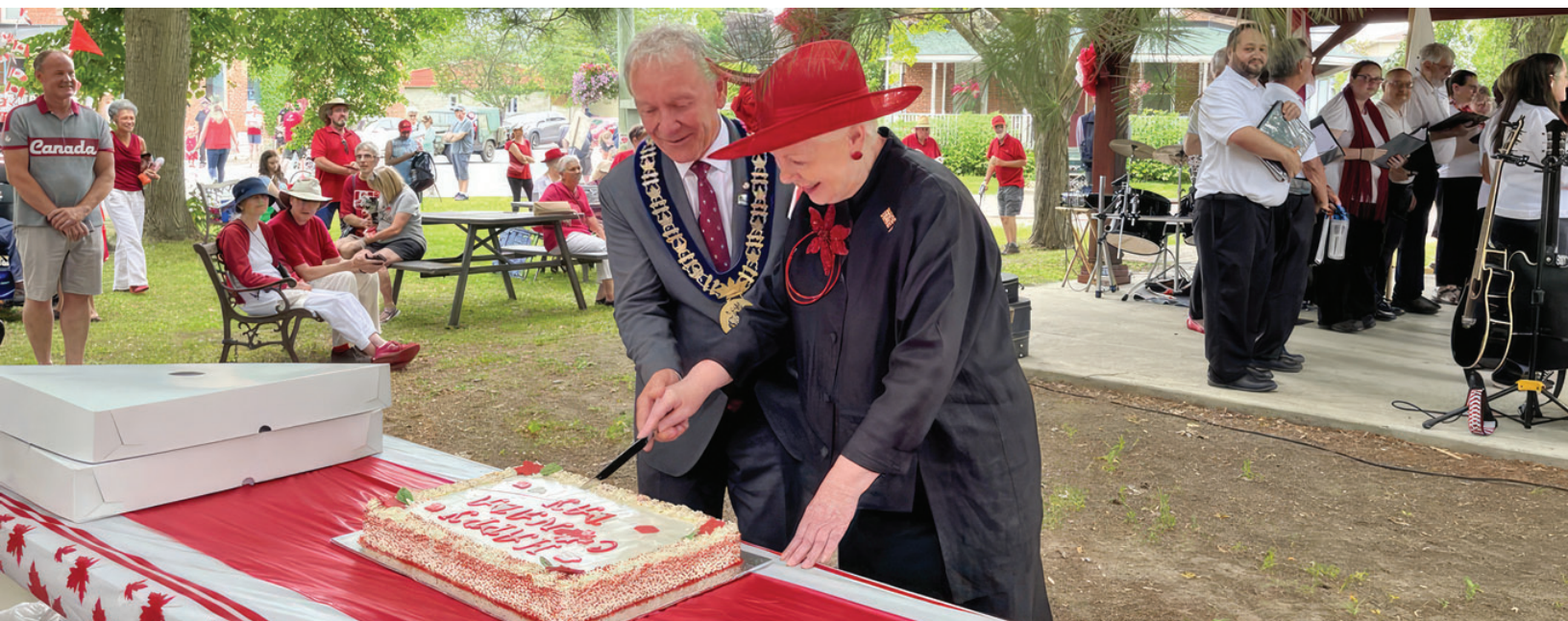
Folk from Prescott and area gathered together to celebrate the Platinum Jubilee - cake cut by the Lieutenant Governor of Ontario.

by helping to organize your community in a Neighbours & Newcomers Celebrate the Coronation event (joining to the occasion your experience of what worked, or what you intended to do but couldn't quite make happen in Jubilee year) and find a Mayor or Councillor to support you in a project ranging from anything such as planting trees to celebrate The King's environmental concerns and nourish our planet, followed by refreshments - to a