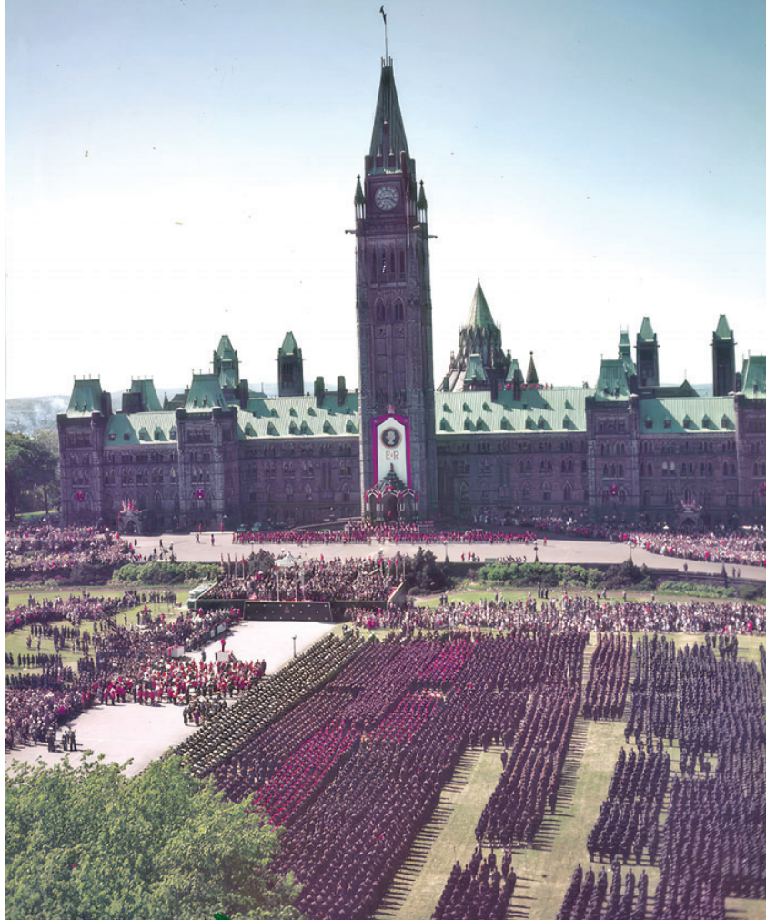
Service d'action de grâces du jour du couronnement sur la Colline du Parlement 1953 Coronation Day Thanksgiving Service on Parliament Hill

CHARLES III, du Canada et de ses autres royaumes et territoires, Roi, Chef du Commonwealth, Défenseur de la Foi.