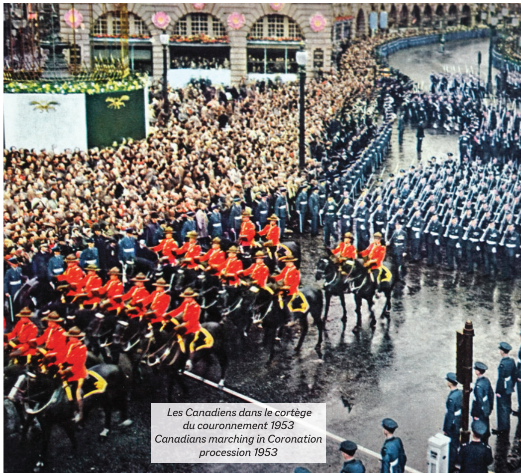
Les Canadiens dans le cortège du couronnement 1953 Canadians marching in Coronation procession 1953

? Quand le gouvernement publiera-t-il le PORTRAIT OFFICIEL DU ROI qu'il a promis ? Depuis plusieurs années, la Ligue distribue celui de notre défunte Reine, et nous continuons à le faire. De nombreux acheteurs expri-