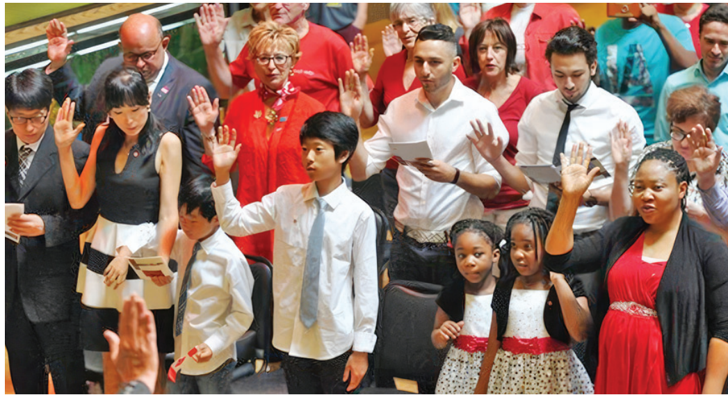
Swearing Oath of Allegiance: a proud moment binding together all Canadians Prêter serment d'allégeance: un moment de fierté qui unit tous les Canadiens

It insults, first and foremost, our new fellow Canadians, who have often spent a great deal of time, navigated the complex immigration process, set off into the unknown, uprooted all that was familiar even if deeply flawed or unsafe – and are so proud to become a part of the family