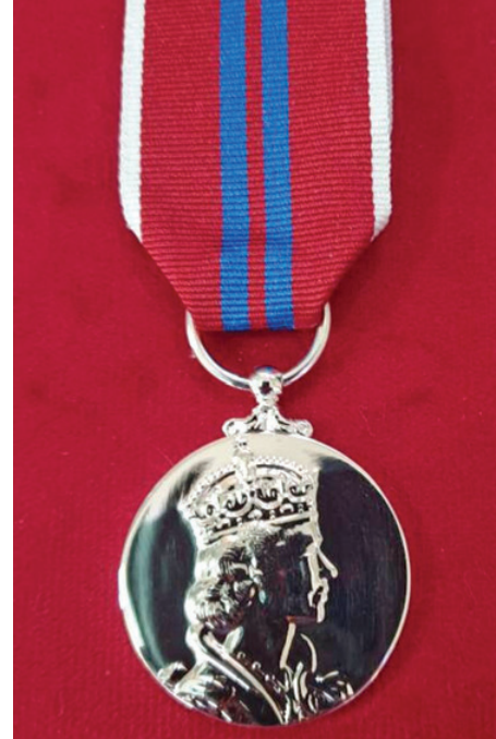
Canadian Coronation Medal 1953 Médaille canadienne du couronnement 1953

? Will VICTORIA DAY continue to be The Monarch's Official Birthday in Canada? And might FEBRUARY 6 be created as a NATIONAL DAY OF SERVICE and called ELIZABETH DAY? If not, why not?