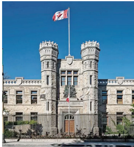
Royal Canadian Mint la Monnaie royale canadienne

? Reports abound that elements within the PMO and Canadian Heraldic Authority, whether of its own volition or by government encouragement we are unsure, may be preparing for THE ROYAL CROWN BE REMOVED AS THE SYMBOL OF AUTHORITY IN CANADA (it appears