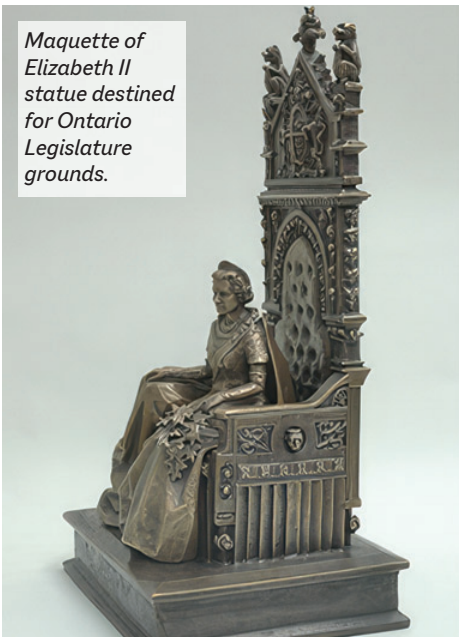
Maquette of Elizabeth II statue destined for Ontario Legislature grounds.