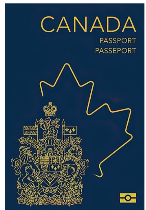
Revised Passport cover displays Canadian Royal Arms

I appreciate your efforts as Inuit educators, and encourage you to continue building on the connections made over the course of this gathering for the benefit of students and teachers alike.