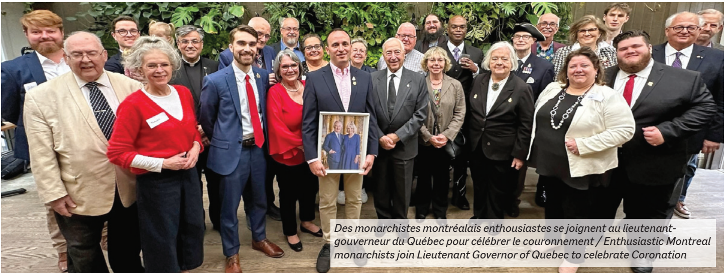
Des monarchistes montréalais enthousiastes se joignent au lieutenant-gouverneur du Québec pour célébrer le couronnement / Enthusiastic Montreal monarchists join Lieutenant Governor of Quebec to celebrate Coronation

Alors que l'événement tirait à sa fin, de nombreux membres ont parlé du désir d'organiser des événements comme celui-ci et de leur satisfaction d'avoir trouvé un moyen de célébrer. La section québécoise de la Ligue espère que ses événements deviendront plus fréquents. Un véritable succès et une participation étonnante. Huzzah au Roi et à nos fidèles membres!