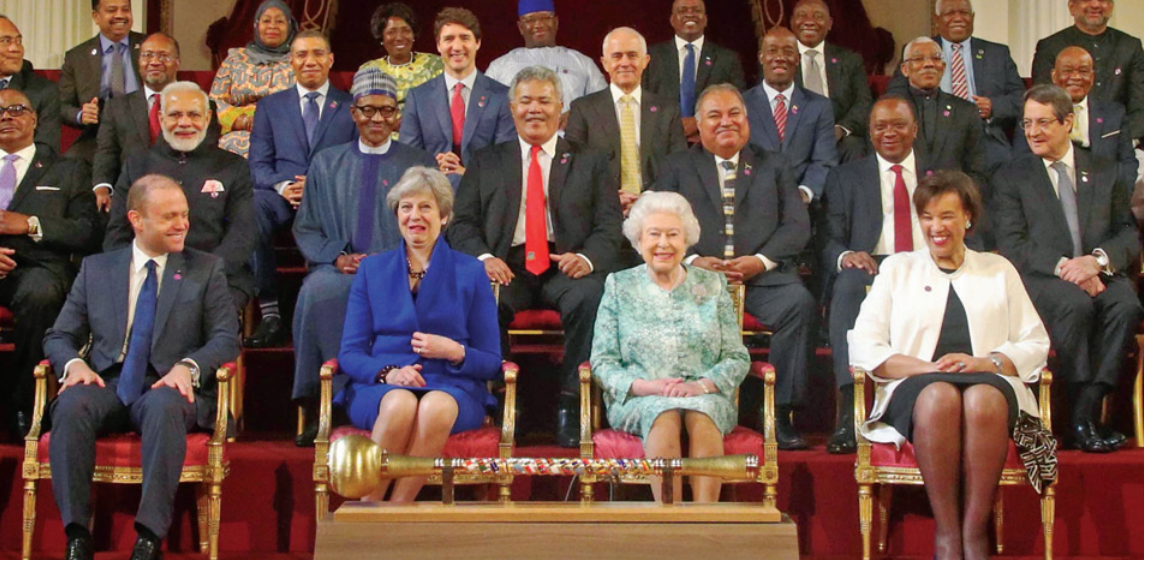
Our Queen: admired Head of multi-racial Commonwealth