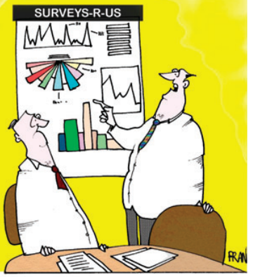
87% OF THE 56% WHO COMPLETED MORE THAN 23% OF THE SURVEY THOUGHT IT WAS A WASTE OF TIME

stitutional change and shifting our system of government, that's fine. They can have those conversations. But right now, I'm not having those conversations." However, we are informed reliably that he has no intention whatsoever of touching the issue.