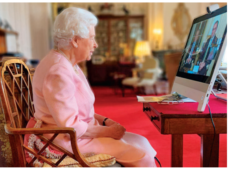
Queen's Zoom call with South Australia Governor & Premier

a pitch-perfect statement on the controversy - what an example for the rest of us who grumble about isolation or standing in lines for shots and shopping!