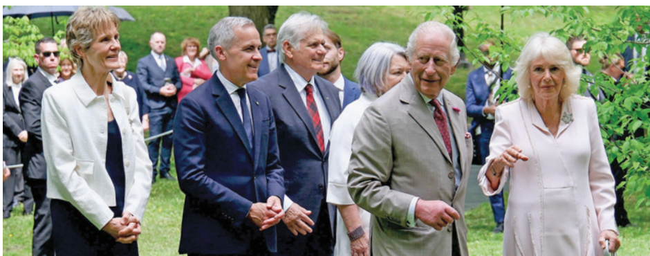
King Charles III participates with Queen Camilla, Canadian Prime Minister Mark Carney, and Governor General of Canada Mary Simon in a ceremonial tree planting in Ottawa, May 26, 2025.

On behalf of the Government of Canada, I extend my warmest wishes to His Majesty The King on this special day. May the year ahead bring him continued health, happiness, and strength in service."