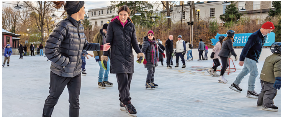
A 150 year tradition of the public's enjoying skating at Rideau Hall recently reinforced by gifts given by Power Corporation of Canada, the Rideau Hall Foundation and the National Capital Commission. The ice will now be available six months annually. • Une tradition vieille de 150 ans qui consiste à permettre au public de patiner à Rideau Hall a récemment été renforcée par des dons de Power Corporation of Canada, de la Fondation Rideau Hall et de la Commission de la capitale nationale. La patinoire sera désormais accessible six mois par an.

I want to thank Power Corporation of Canada, the Rideau Hall Foundation and the National Capital Commission for making this possible. We truly appreciate the energy and passion you've poured into this project ... to make this rink ... Canada's rink!