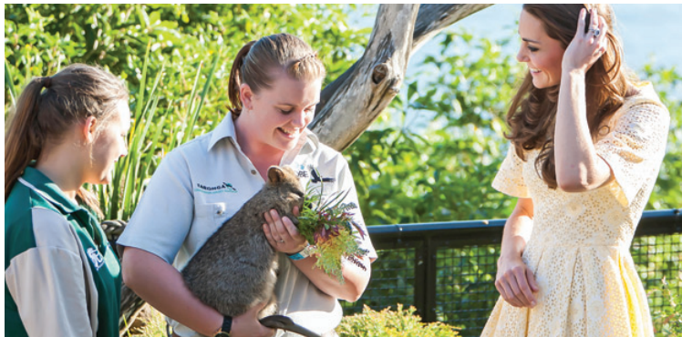
Duchess of Cambridge visits Taronga Zoo, Sydney in April 2014 • La duchesse de Cambridge visite le zoo Taronga, à Sydney, en avril 2014.

A referendum was held in 1999 about whether Australia should become a republic, but it was rejected by 55 per cent of voters, and surveys show that a majority of Australians would still rather stick with the status quo. When King Charles visited in October 2024, a Roy Morgan poll found 57 per cent of Australians surveyed believed the country should remain a constitutional monarchy, while 43 per cent said Australia should become a republic with an elected president. Mr Albanese spoke in 2020 of "the need for us to have an Australian head of state ... the need for us to stand on our own two feet". Despite his views, since becoming prime minister in 2022 he has pledged allegiance to the King and said he would put the referendum issue on the backburner.