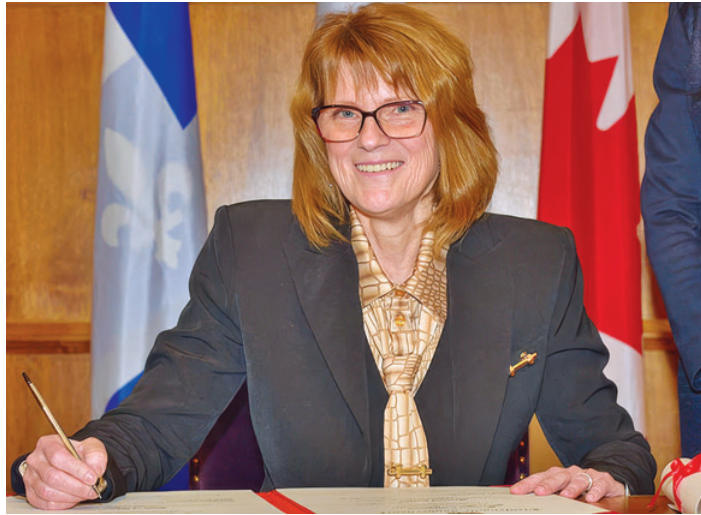
Lieutenant Governor of Quebec, Manon Jeannotte.

In October of this year, the government proposed changing the title to “Officer of Quebec” via the Executive Power Act. Thought unconstitutional, this proposed change is being challenged as unconsti-