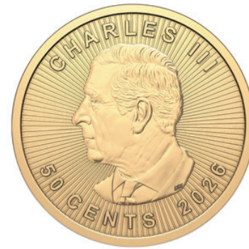
Three Royal Canadian Mint coins: left, recto of the Gold Maple Leaf 1 ounce pure gold centre, verso of His Majesty King Charles III's Royal Cypher, Limited Edition Proof Silver Dollar marking his coronation. right, recto of the 2026 Maplegram26™ 1 gram pure gold.

On May 6, 2023, the Government of Canada announced that the next $20 bank note will continue to feature a portrait of the reigning monarch, King Charles III. At the coronation of His Majesty King Charles III, the Government of Canada announced that the next $20 bank note will continue to feature a portrait of the reigning monarch. May found The Minister of Finance confirming that the Canadian National Vimy Memorial will remain on the back of the note. “We’ve since started the design process for the next $20. This includes historical and visual research and talking to experts and the Bank’s Indigenous Advisory Circle.”